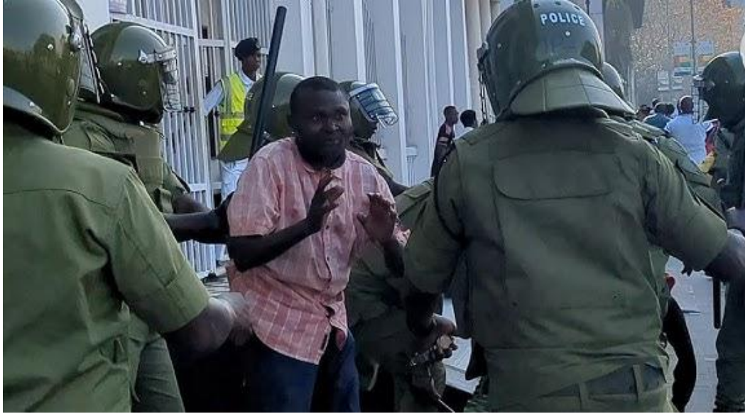
A Tanzanian being rounded up and beaten by Tanzania police force. His crime was to attend the court hearing of leading opposition leader Mr. Tundu Lisu who is being held in isolation for treasonous charges in a Dar es Salaam Prison.