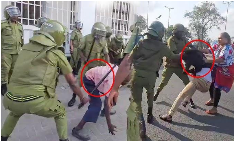
Innocent civilians in Dar es Salaam facing the wrath of Police brutality during the months leading up to the contested October 29 th elections.